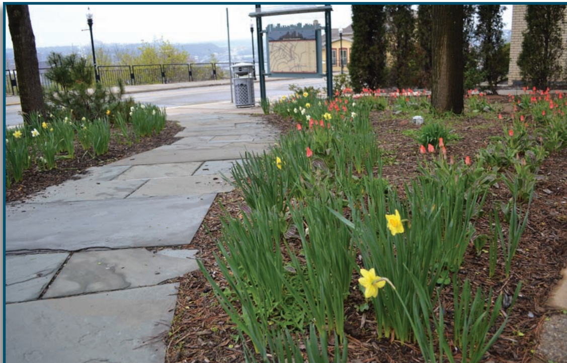
Spring is on its way to the Mount!