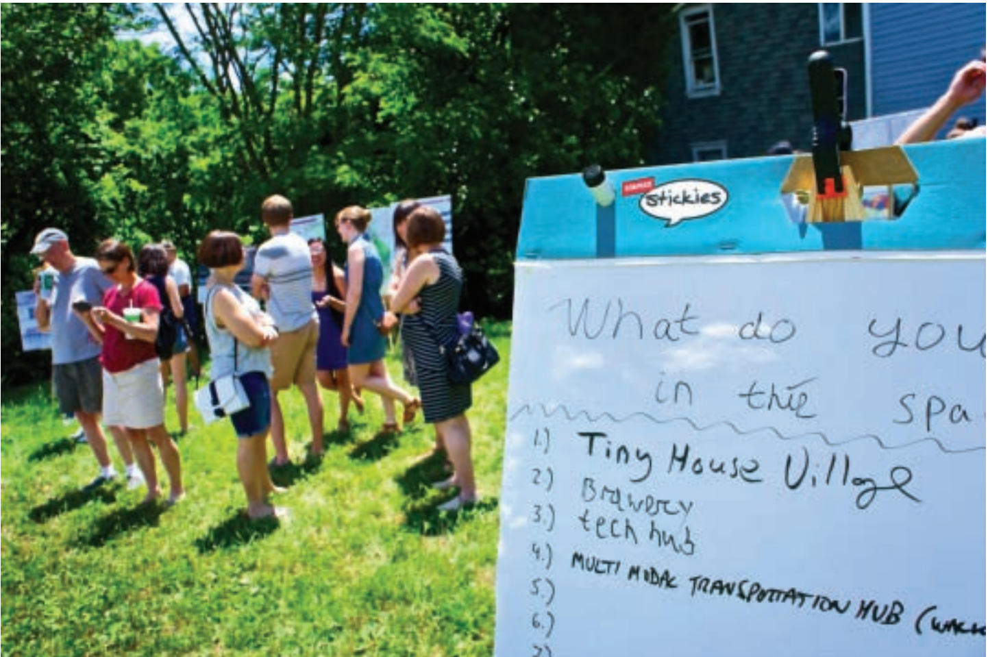
At the awards ceremony, visitors had the opportunity to share their ideas for the development site.