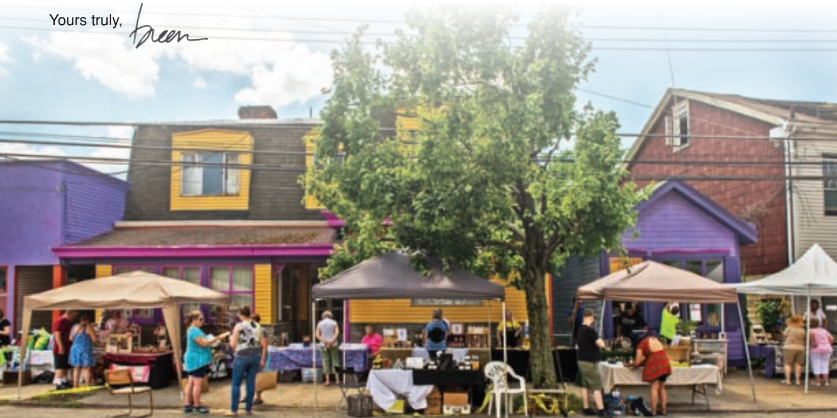
Three vacant properties on Boggs were the backdrop for a Next 3 Days street fair featuring Pittsburgh artisans. More photos on pages 6 & 7.